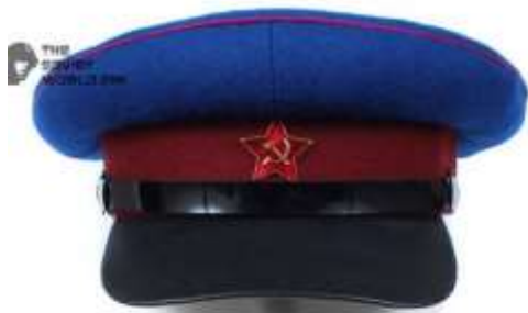
Soviet Russian NKVD Officer's dark blue visor hat WWII. This headdress was entered in use in 1935 for NKVD Officers and applied until 1953