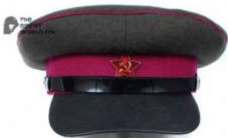
Soviet russian RKKA Infantry Officer's visor hat Red Army cap The headdress of Infantry Officers of soviet Red Army was

Basecoat - Basic brush All Khaki 70.988 (115)